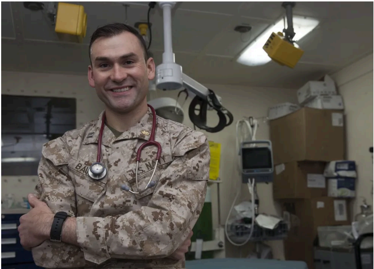
Military doctors know what is going on, but they are not permitted to talk about it.